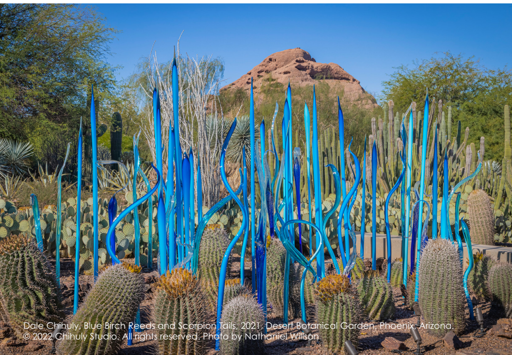
Dale Chihuly, Blue Birch Reeds and Scorpion Tails, 2021, Desert Botanical Garden, Phoenix, Arizona. © 2022 Chihuly Studio. All rights reserved.

DISFRUTA LA EXPOSICIÓN CHIHULY IN THE DESERT ACÉRCATE A MILES DE mariposas DESCUBRE MÁS DE 50,000 PLANTAS DESÉRTICAS EXPLORA 5 RUTAS mágicas PARTICIPA EN EXCURSIONES Y OTRAS ACTIVIDADES Y diviértete CON TU FAMILIA